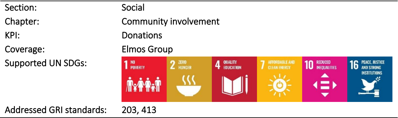
Donations for charitable purposes 1 (EUR)