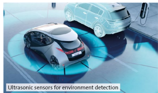
Ultrasonic sensors for environment detection

Measuring distances and detecting the environment using ultrasonic sensor ICs is a long-time proven, reliable and highly efficient technology. As a market leader, Elmos has already delivered more than 1.4 billion ultrasonic ICs worldwide.