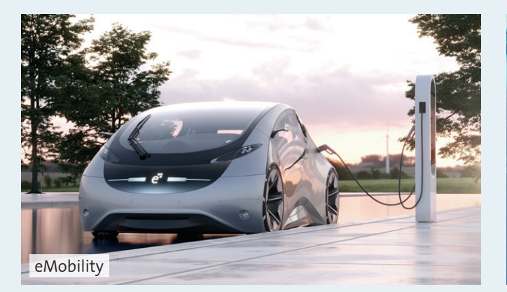
Elmos Semiconductor SE Sustainability and Non-financial Group Report 2022