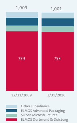
Staff development ELMOS Group (balance sheet date)

Within the scope of voting rights notifications it was announced in January 2010 that the company's shares formerly held directly and indirectly by EFH ELMOS Finanzholding GmbH are distributed among the partners of (extinct) EFH ELMOS Finanzholding GmbH, namely Dr. Weyer GmbH & Co. Vermögensverwaltung KG (20.50%), Jumakos GmbH & Co. KG (16.67%), and ZOE GmbH & Co. KG (15.71%). The quoted respective shares in voting rights are held indirectly by these companies.